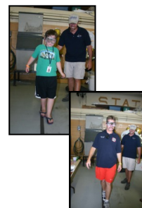
Slaughter Beach Open House, "Walk the Line"