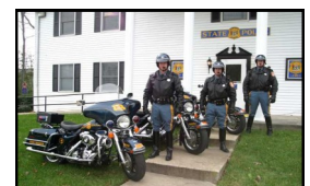
Harley Davidson Electra-Glide Motorcycles, equipped with Stalker Radar, Lidar technology and mobile data computers.

"In the rush to get to their destination to enjoy the surf and sand, our visitors (and some local residents as well) tend to forget the importance driving safely and wearing a seatbelt."