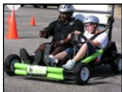
SIDNE (impaired driving go-kart)

"I am very excited about the new opportunity as the new CTSP for Sussex County. . ."