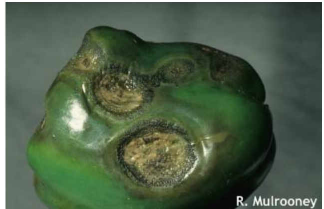
Anthracoze on pepper fruit.

After harvesting, pepper fields should be disked and plowed under thoroughly to bury crop debris.