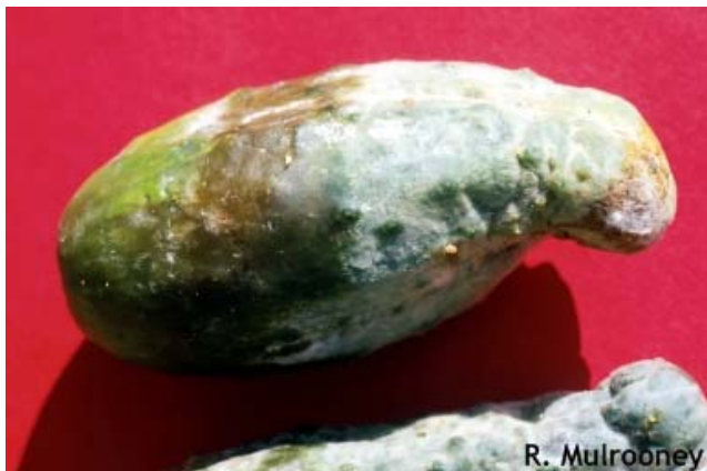
Phytophthora fruit rot on pickling cucumber