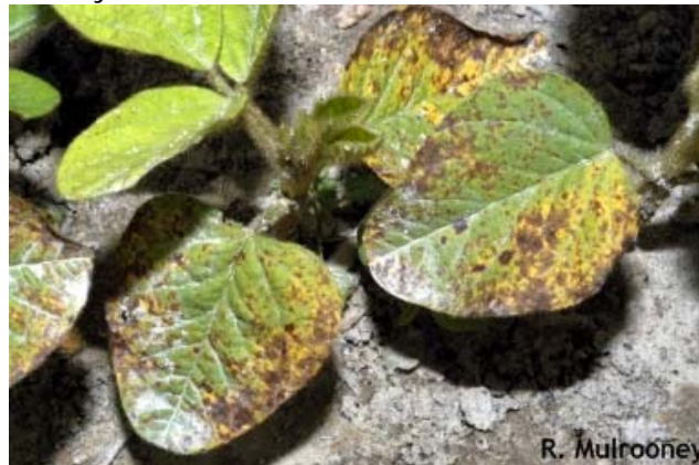
Septoria brown spot on unifoliolate leaves of soybean

Septoria brown spot has been favored by all this wet weather and is easily found on the unifoliolate leaves and the lower trifoliolate leaves in most areas. These will usually fall from the plant and if it dries out we will not see this disease again until the soybeans canopy and conditions again would be favorable for infection. Most seasons this disease is not yield limiting. Spots seen this week were small but very numerous in one variety trial that I checked.