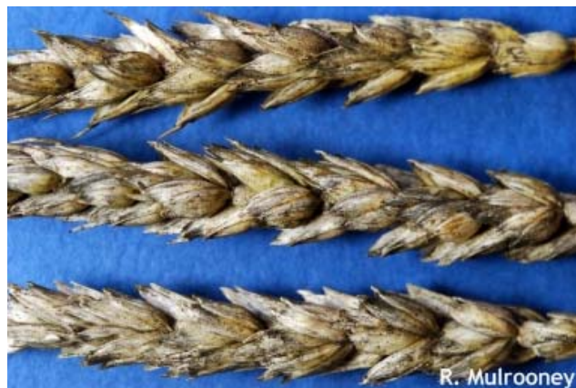
Sooty mold on wheat heads

barley. They are superficial dark fungi that discolor the heads but do little to reduce test weight or yield. That has already occurred before they infect the heads. Heading applications of fungicides, especially the strobilurins, will eliminate them or greatly reduce them – which also translates into good straw quality as well.