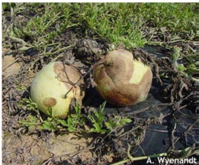
Phytophthora fruit rot of watermelon